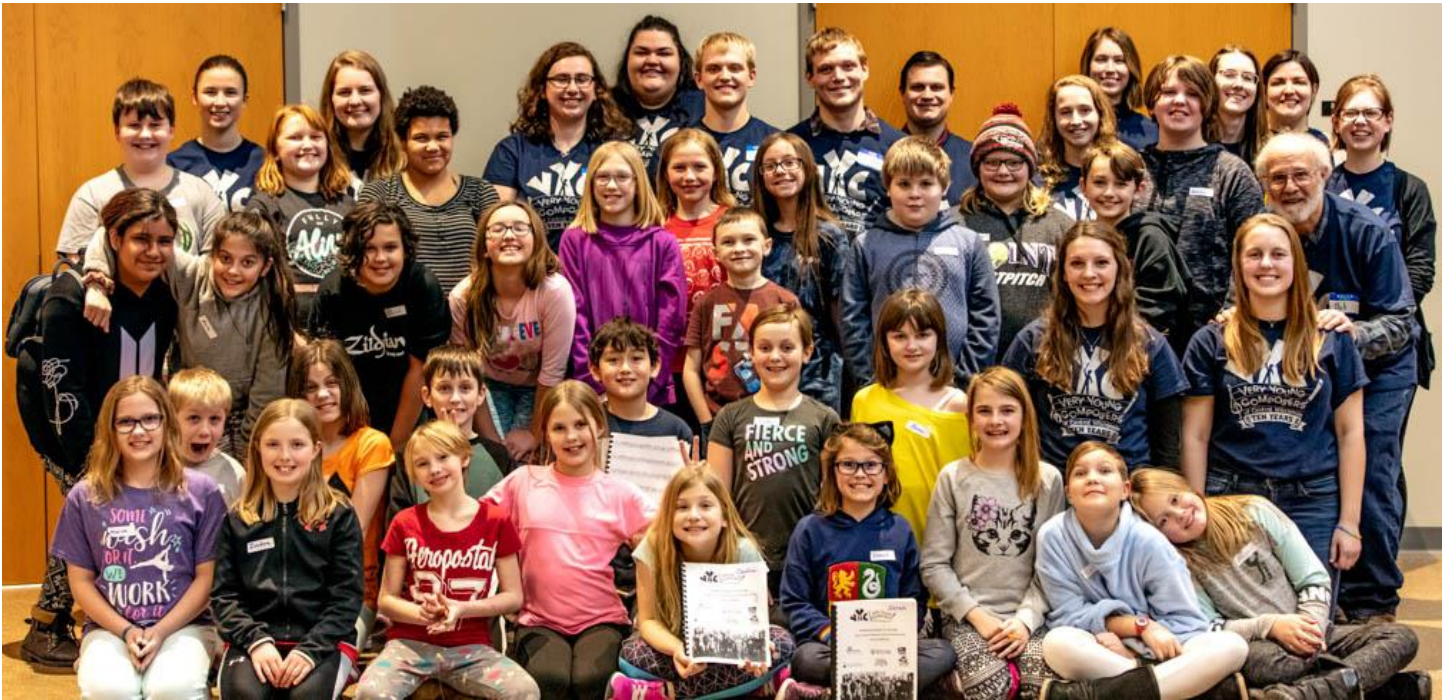
VYC Class of 2020